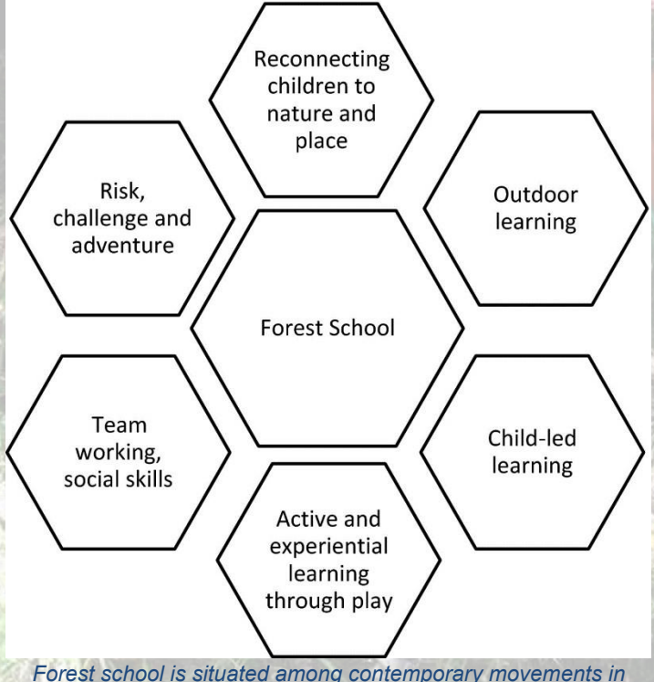
Forest school is situated among contemporary movements in education and child development (Harris, 2018).

'The Wilderness' is also home to a number of mature canopy trees includingsycamore, ash, elm, lime and horse chestnut. The presence of these trees enhances the natural environment, resulting in a higher level of biodiversity, making for lots of interesting bug hunts. They also provide great places to build dens!